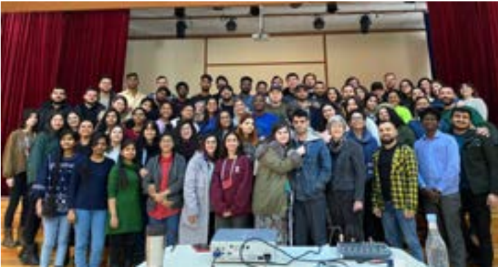
Armenian and English Alpha Course